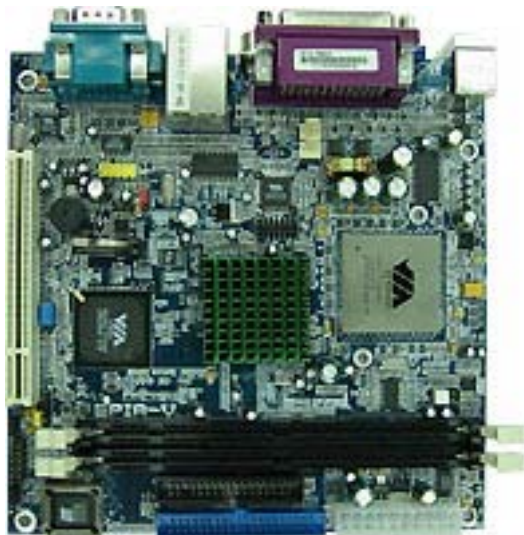
Socket 370 Mainboard with onBoard mounted VIA C3 CPU/ 800 MHz