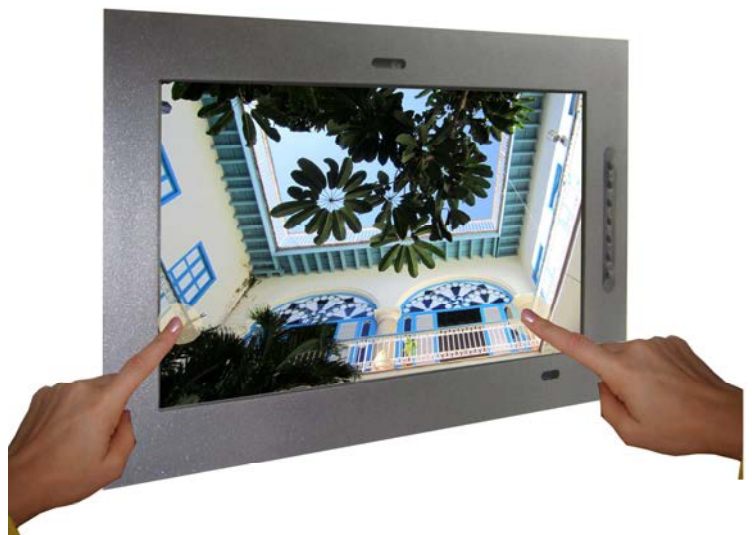
optionaler Rahmen für Panel-Montage