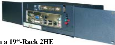
1 Unit in a 19"-Rack 2HE