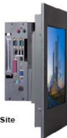
TFT- Back-Site Mounting