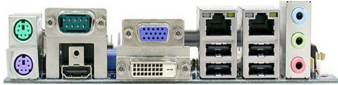
Back Site I/O Shield