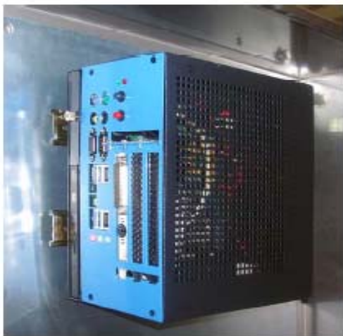
DIN Rail Mounting