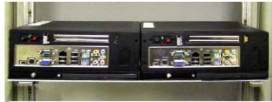
2 Units in a 19"-Rack 2HE with Telescope Rails