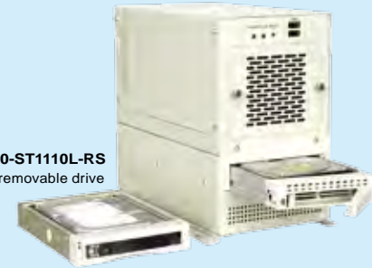
3.5" SATA removable drive bay compatible