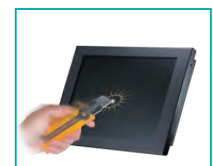
Anti-Reflection Strengthen Glass