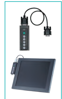
Key Pad Bracket Kit