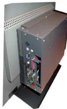
Holder for Mini-IPC Back-Site Mounting