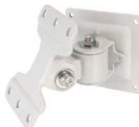
Additional : Wallmount Kits ( fix or turnable)