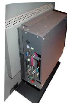
Holder for Mini-IPC Back-Site Mounting