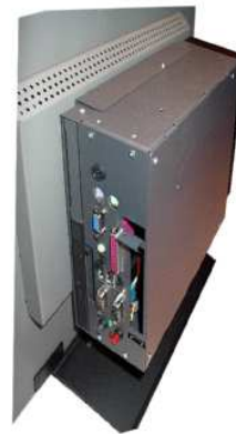
Holder for Mini-IPC Back-Site Mounting