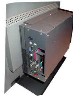
Holder for Mini-IPC Back-Site Mounting