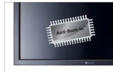
Anti-Burn-in™ technology prevents image sticking