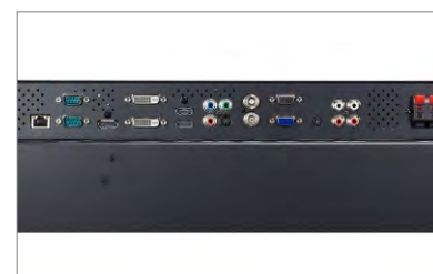
Multiple video inputs (VGA, DVI, HDMI, BNC, S-Video, DisplayPort and Component) allow for effortless system integration