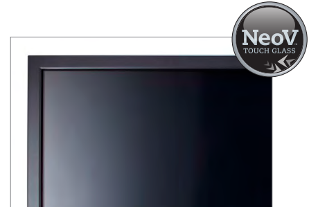
NeoV™ Touch Glass keeps the screen protected and looking new