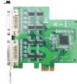
ESC8232 8-port RS232 PCIe1 Card