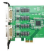
ESC8485 8-port RS232/422/485 PCIe1 Card