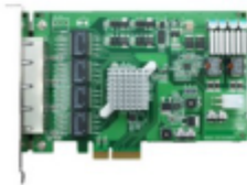
PE3504 Intel® I350 PoE Card