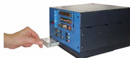
Pass. Mini-IPC Gehäuse