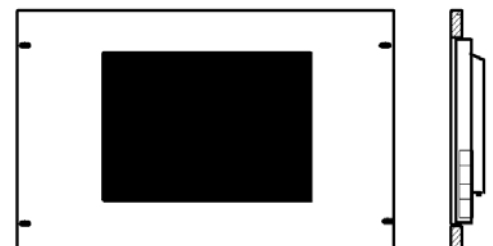
19" Mounting with Mounting Kit