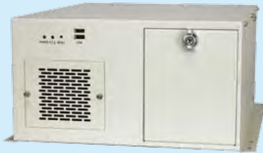
10-slot Full-size Compact Chassis