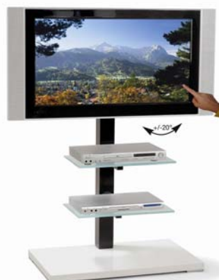
Table Stand Type -Landscape (Optic)