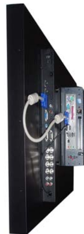
Holder for Mini-IPC Back-Site Mounting