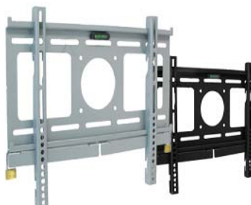
Optional : Wallmount Kit