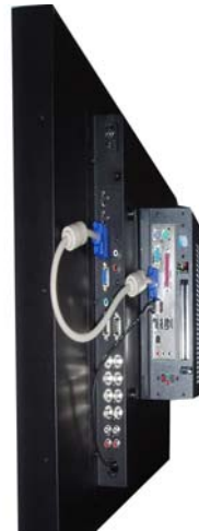
Holder for Mini-IPC Back-Site Mounting