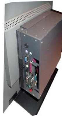
Holder for Mini-IPC Back-Site Mounting