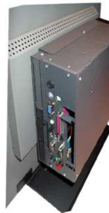
Holder for Mini-IPC Back-Site Mounting