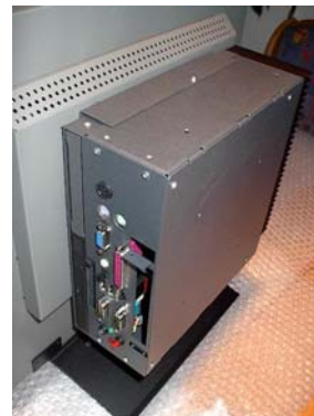
Holder for Mini-IPC Back-Site Mounting