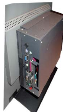
Holder for Mini-IPC Back-Side Mounting