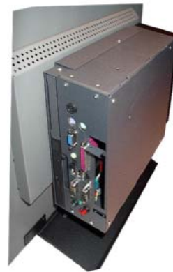
Holder for Mini-IPC Back-Site Mounting